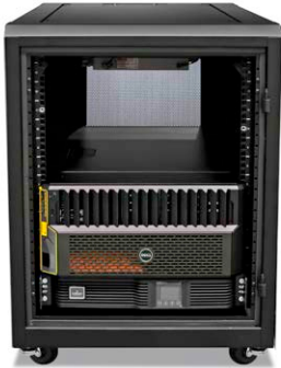
Vertiv SmartCabinet for Dell EMC VRTX SKU: A8195977

The Dell EMC VRTX simplified the IT infrastructure at ROBO offices, and now the Vertiv™ SmartCabinet™ for Dell EMC VRTX will simplify the deployment of Dell EMC VRTX.